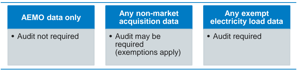
Figure 2.1 AESS audit requirement categories

There are three categories of AESS audit requirements, as follows: